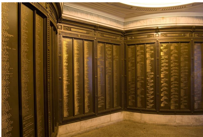
South Australian National War Memorial